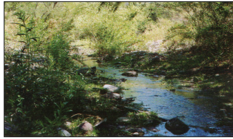
Riparian area along the Gila River in Pinal County

If you need to begin the 208 Amendment process, are not sure if an amendment is required, or have questions, contact CAAG and obtain an information package. This includes documentation relevant to 208 planning, pertinent excerpts from the CAAG 208 Areawide Water Quality Management Plan (AWWQMP), and details on submitting your plan. You may also set up a meeting with CAAG to discuss your project further, and receive general guidance on proceeding with the 208 process. If a proposed plan is within the current planning boundary of a city, town, sanitary district, improvement district, or with a Designated Management Agency (DMA), you will need to contact that agency before proceeding with the CAAG process.