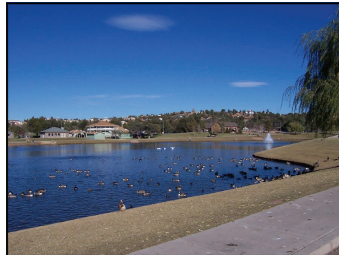
Green Valley Park in Payson, Arizona uses a man-made lake not only as a community enhancement, but also as a reclaimed water retention basin.

Phone: (480) 474-9300 Web: www.caagcentral.org