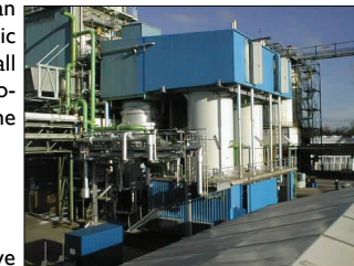
Sequence Batch Reactor (SBR)

Upon certification by ADEQ, a submission package is created and submitted to the U. S. Environmental Protection Agency, Region IX in San Francisco. If the ADEQ WQM Coordinator does not receive a written reply within 120 days, the amendment is automatically approved. Note: a DMA creation or expansion must receive written approval from EPA, rather than an automatic approval without documentation.